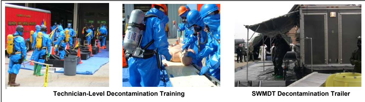
Technician-Level Decontamination Training